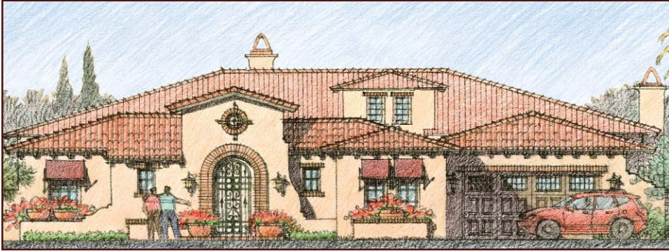
Early California - A