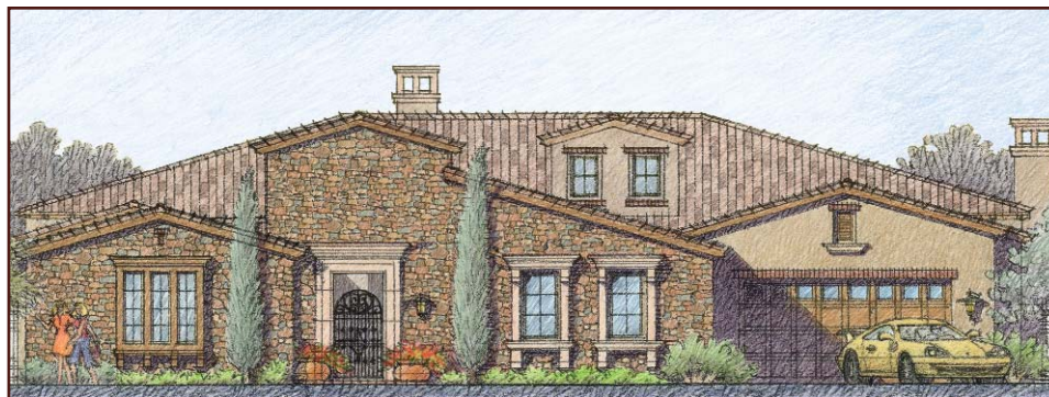
Tuscan - D