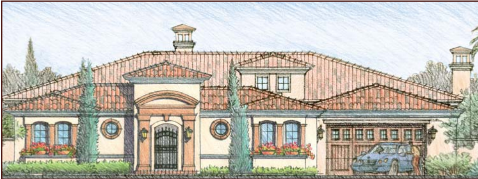
Italianate - E