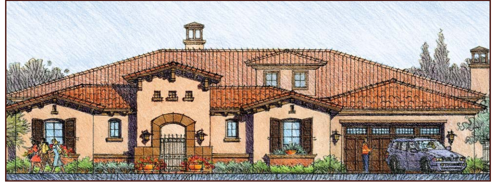
Italianate - B