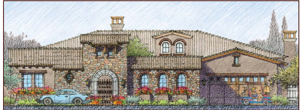
Tuscan - C - Model