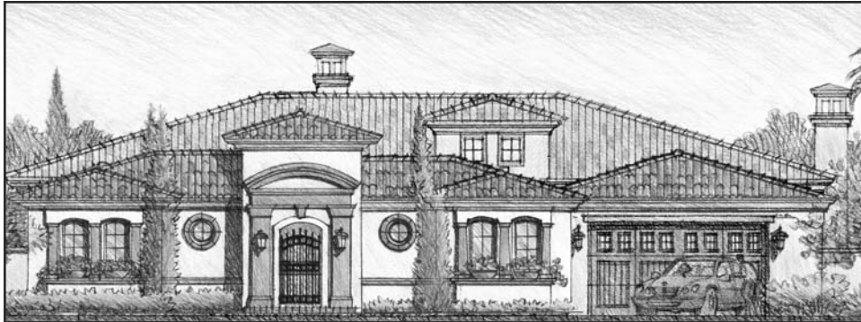
Italianate - E