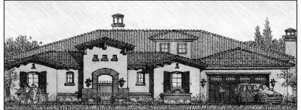
Italianate - B