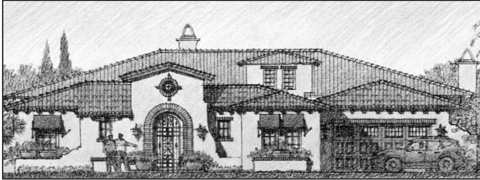
Early California - A