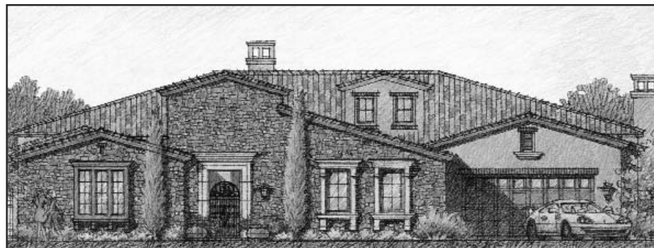
Tuscan - D