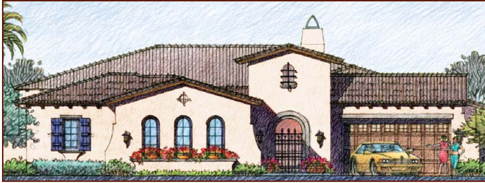
Early California - Model