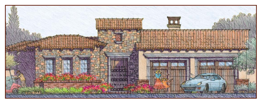
Tuscan - C1