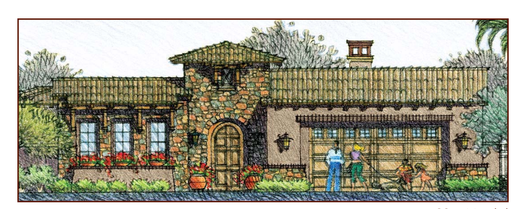
Tuscan - C2 - Model